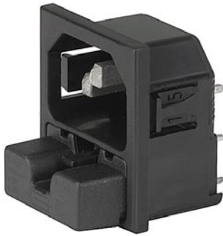
Appliance inlet with fuseholder