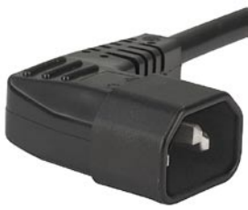
power interconnection cord