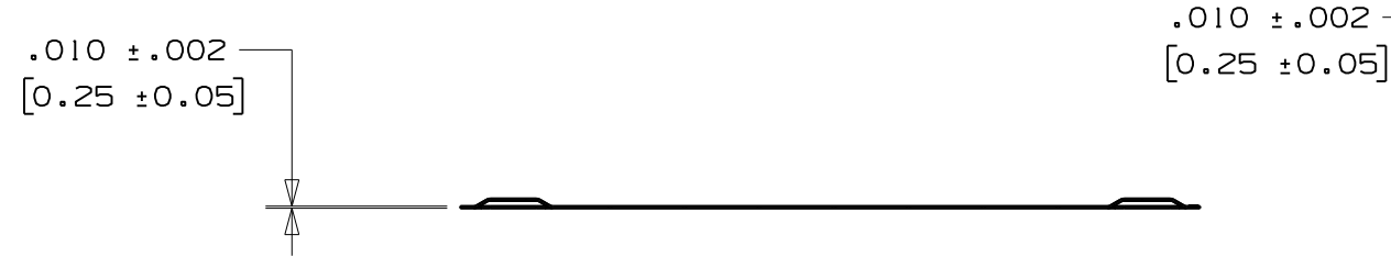
SECTION A - A SCALE 1:1